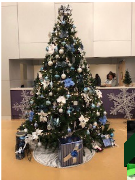
Christmas tree display for the Mayors' Motorcade lunch.

Thank you to everyone who donated for the annual Mayors' Motorcade. A special thanks to Riverside Baptist Church and the Vienna Garden Club. All the donated gifts helped bring joy to the hospital during the Christmas season.