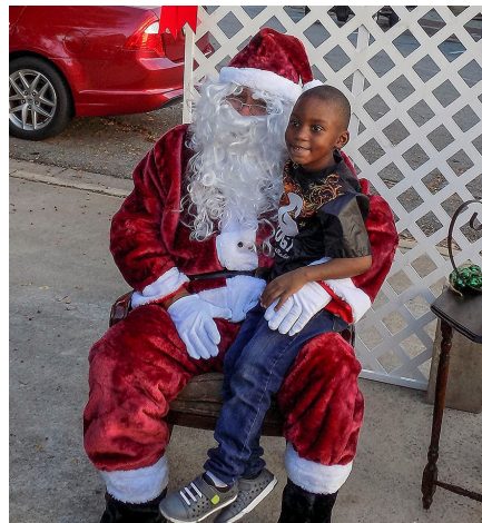
Santa Clause & Child