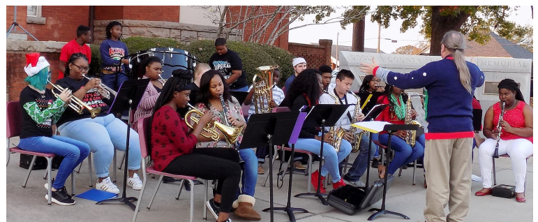
DCHS Band Perform