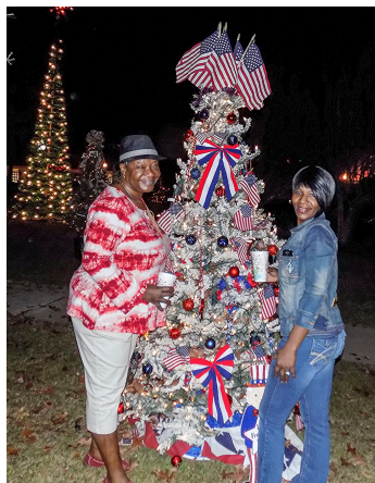
Guests Enjoy 1st Place Veteran's Tree