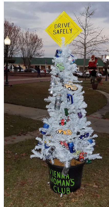
3rd Place - Vienna Woman's Club

Thank you to all the participants in the Christmas Tree Decorating Contest. You all helped beautify and bring Christmas cheer to Vienna's City Square!