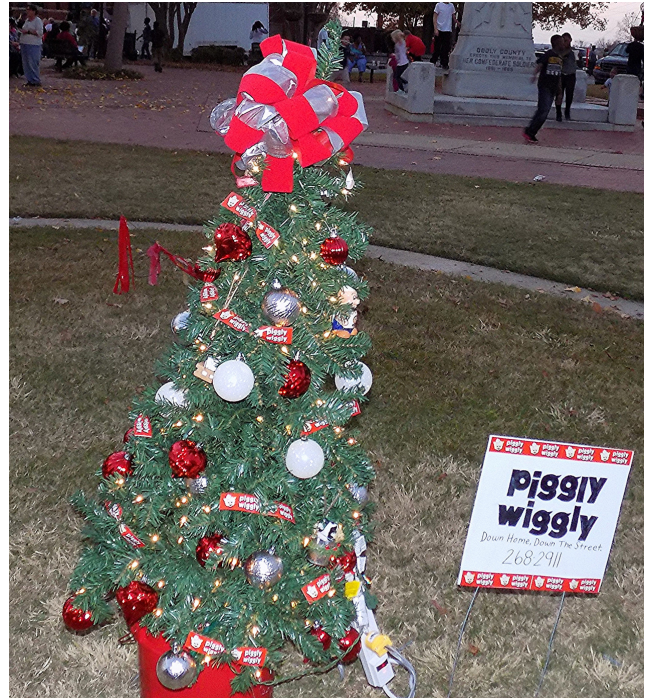
2nd Place - Vienna Piggly Wiggly