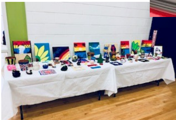
Artwork by the clients of the hospital