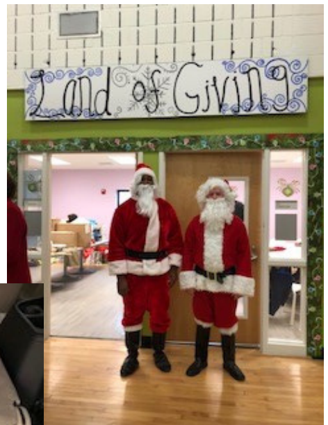
Santas in front of the donation room