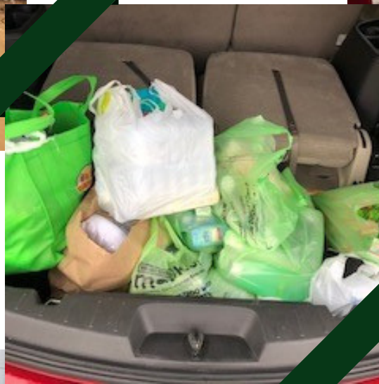
Donations collected in Vienna