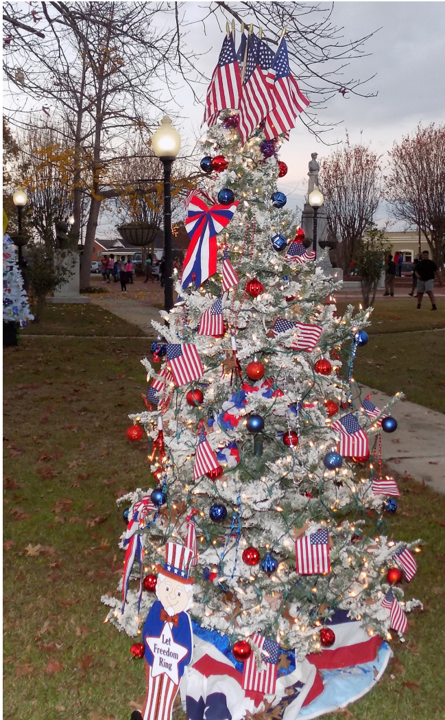
1st Place - The Jewell of Vienna B&B