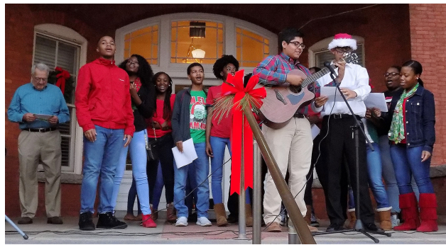
DCHS AP World History Class Perform

Santa Claus was in attendance, as well as other local musical performers for entertainment. Hot chocolate and cookies were served and the Tree Decorating Contest winners were announced. There was a great crowd turnout. Thank you to everyone who attended and to all the volunteers who helped make this event a huge success! Photos courtesy of Tim Franzen, The News Observer Reporter.